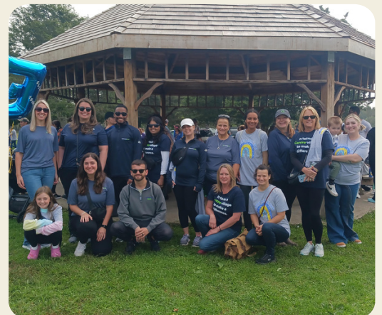
Down Syndrome Rhode Island Buddy Walk

Our United Way Campaign is an annual fund drive that gives employees the opportunity to make charitable contributions to non-profit organizations of their choosing. Each donation is then matched dollar-for-dollar by the Centreville Bank Charitable Foundation. Our team's commitment to take action made this year's campaign a huge success, collectively raising over $81,000 for 60+ organizations.