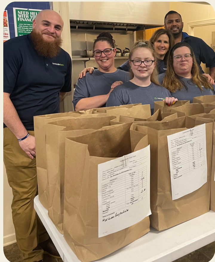
Contact Center Team at Interfaith Human Services - Putnam

We support community-based organizations with funding to help improve organizational effectiveness.