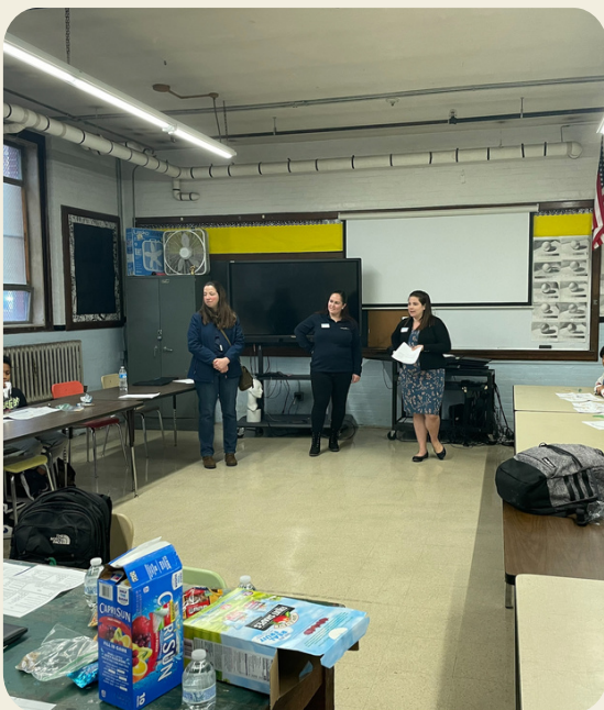
Financial literacy session in partnership with Onward We Learn