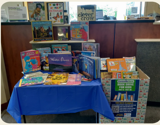
Annual children's book drive benefiting Read to Grow and Books are Wings