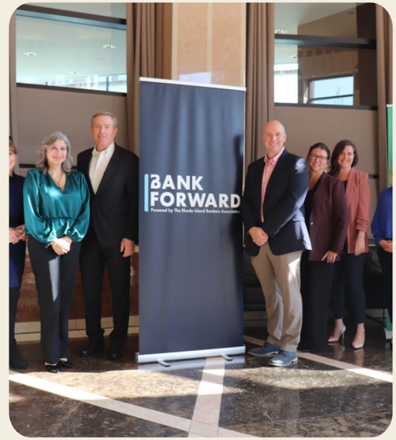
Centreville staff at Bank Forward launch event

In partnership with the Rhode Island Bankers Association, Centreville Bank is one of the lead funders of this initiative. In addition, Centreville employees are slated to participate in various events, panels, and mentorship opportunities.