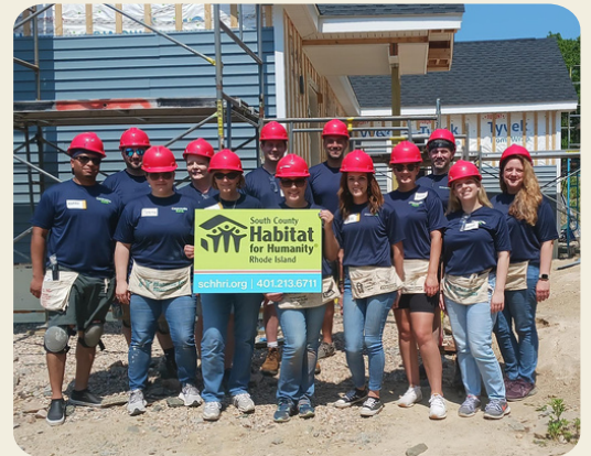
Habitat for Humanity of RI South County Build

At Centreville Bank, we know it is the people-power and human connection that truly build community. That's why we empower our staff to get involved by providing paid volunteer time every year. In 2023 we saw a record 85% employee participation, with our staff collectively volunteering over 5,000 hours. The most ever in a single year!