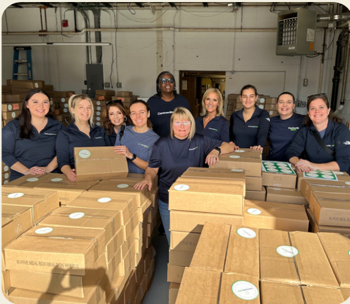
Meals on Wheels Emergency Food Kit Packing

We encourage employees to bring their skills, passion, and insights to community-centered organizations and help coordinate and execute philanthropic activities while identifying relevant needs in our communities. Through both the Bank and individual efforts, our team volunteered with 143 organizations across Rhode Island and northeastern Connecticut.