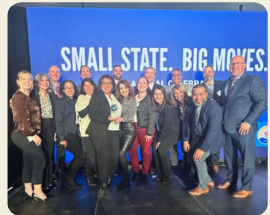
Centreville staff accepts United Way Partner United Award at 97th Anniversary Celebration

Centreville has been a long-standing partner of United Way on several shared community development priorities, and has raised over $648,000 in the last five years to support United Way and its causes.