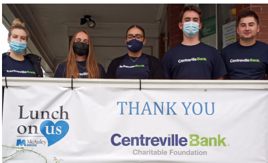
At the McAuley House in Providence, volunteers helped stock the food pantry and assisted with lunch preparation and serving for clients.