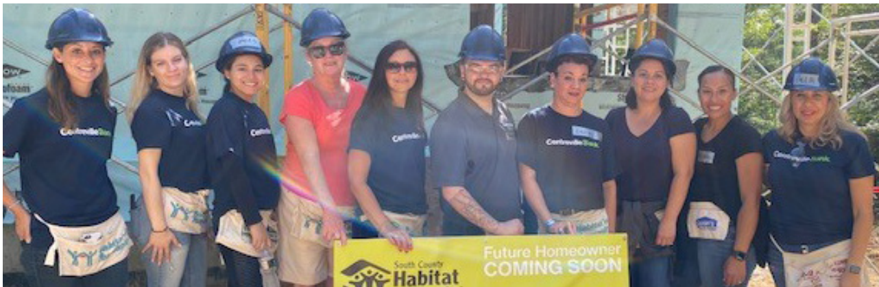
Centreville Bank employee volunteers worked with Habitat for Humanity in South County and Providence to construct affordable housing units for new homeowners.