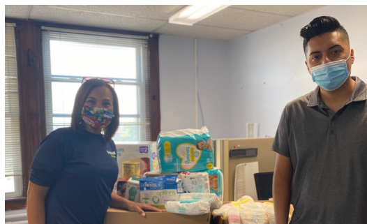
Employees organized a diaper drive in support of local organizations including Progreso Latino .