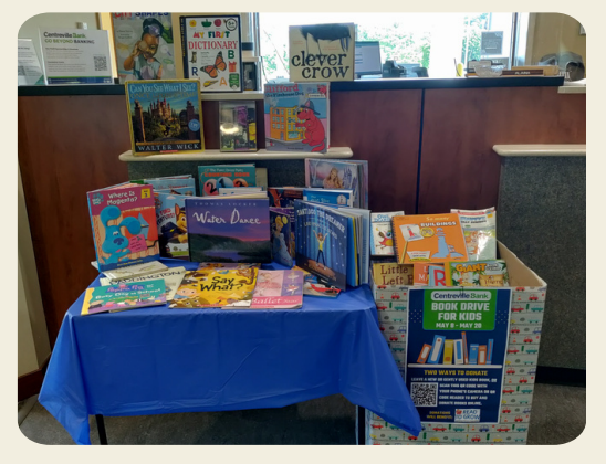
Annual children's book drive benefiting Read to Grow and Books are Wings