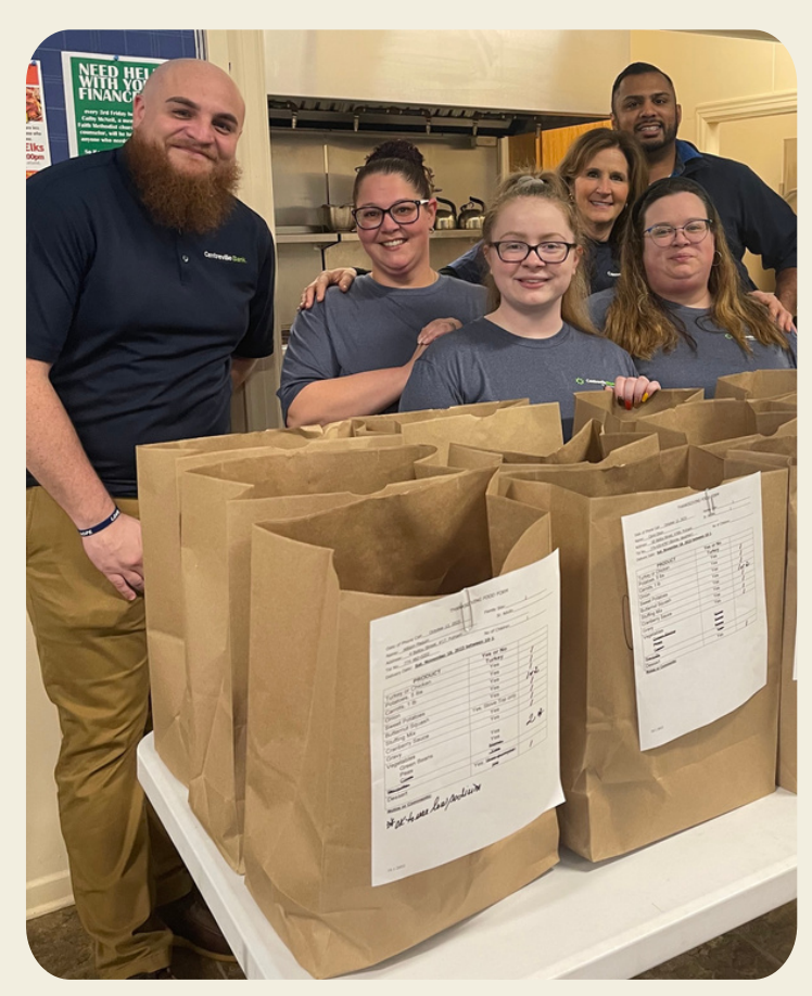
Contact Center Team at Interfaith Human Services - Putnam

We support community-based organizations with funding to help improve organizational effectiveness.