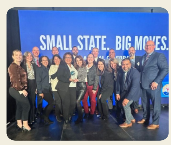
Centreville staff accepts United Way Partner United Award at 97th Anniversary Celebration

Centreville has been a long-standing partner of United Way on several shared community development priorities, and has raised over $648,000 in the last five years to support United Way and its causes.