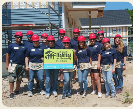
Habitat for Humanity of RI South County Build

At Centreville Bank, we know it is the people-power and human connection that truly build community. That's why we empower our staff to get involved by providing paid volunteer time every year. In 2023 we saw a record 85% employee participation, with our staff collectively volunteering over 5,000 hours. The most ever in a single year!