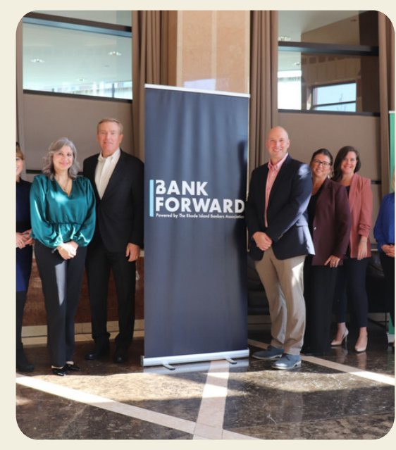
Centreville staff at Bank Forward launch event

In partnership with the Rhode Island Bankers Association, Centreville Bank is one of the lead funders of this initiative. In addition, Centreville employees are slated to participate in various events, panels, and mentorship opportunities.