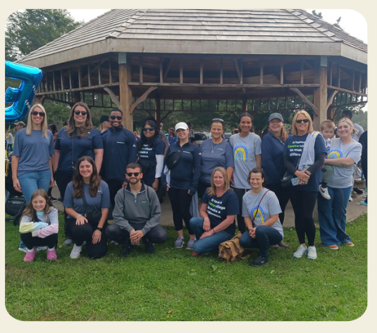
Down Syndrome Rhode Island Buddy Walk

Our United Way Campaign is an annual fund drive that gives employees the opportunity to make charitable contributions to non-profit organizations of their choosing. Each donation is then matched dollar-for-dollar by the Centreville Bank Charitable Foundation. Our team's commitment to take action made this years campaign a huge success, collectively raising over $81,000 for 60+ organizations.