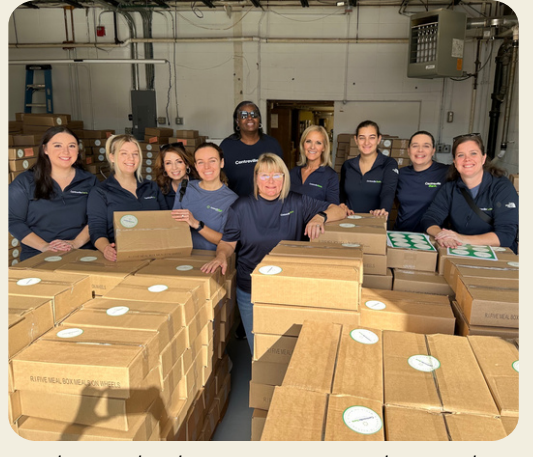
Meals on Wheels Emergency Food Kit Packing