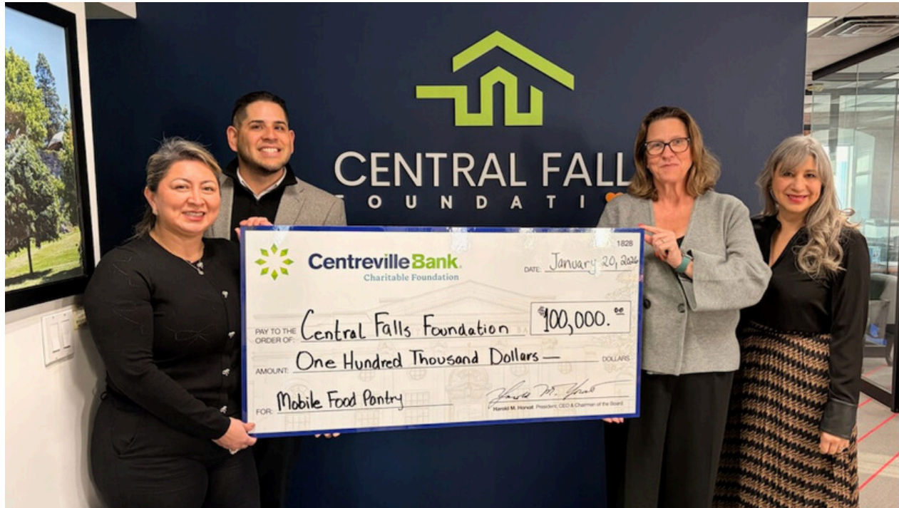
Centreville Bank staff present funding support to Central Falls Foundation.