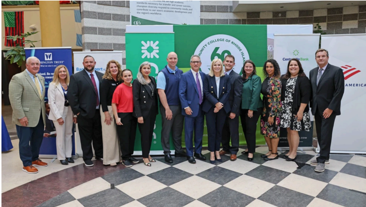
Centreville Bank staff and BankForward partners attend the Banking Micro-Pathway program launch.